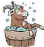
soap that goat

Pronunciation Phrase - igh Open your mouth wide in a relaxed way and say igh igh igh