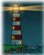
a light in the night

Pronunciation Phrase - ee Smile with your lips apart and say ee ee ee