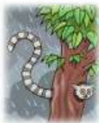
tail in the rain

Phonemes we will be focusing on this week in school -