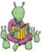
get near to hear

Pronunciation Phrase - ow Open your mouth wide then move your lips together as you say ow ow ow