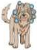
curl the fur