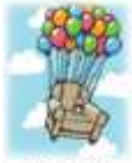
chair in the air