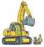
a bigger digger

Pronunciation Phrase - air Open your mouth wide, push your tongue down as you say air air air